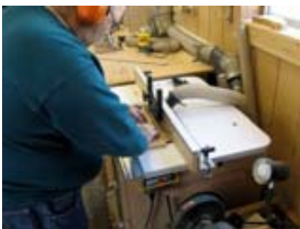
Craig Blankenship on router table