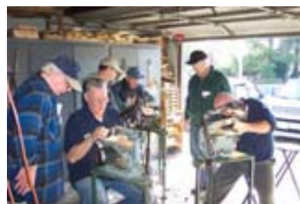
Interested group at the scroll saw SIG.