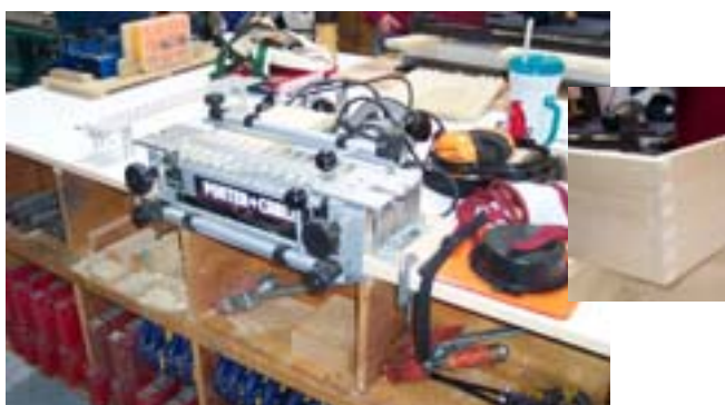
One of the methods demonstrated was the Porter Cable Dove Tail System and the results at the Furniture Projects SIG.