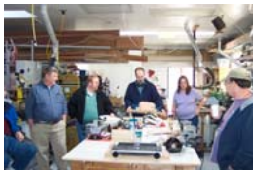
Some of the members at the Furniture Projects SIG.