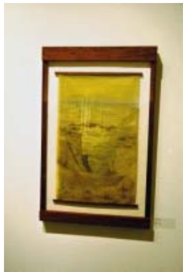
A couple of future project ideas