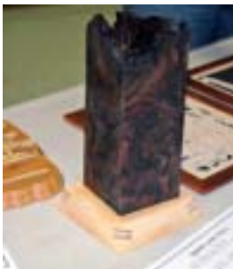
Abe Low brought in this "bottomless" vase.