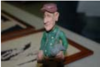
Another beautiful face carving from Joe You