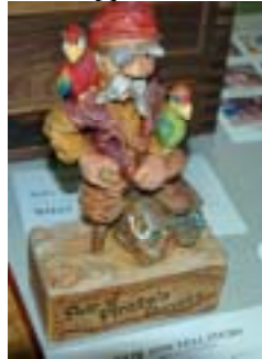
Joe You's great wood carving of a pirate. With the exception of the sword, the carving is out of one piece of wood