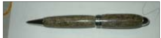
Pen maker, Neil Knutsen is sure no one has used this material for pen making. It is compressed Sun Flower seed husks, called "Dakota Burl".