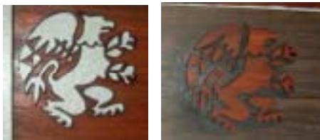
Inlay cutting done with a Laser. Right piece was only a shallow etching and left piece was inserted into it. It was pressed in no glue.