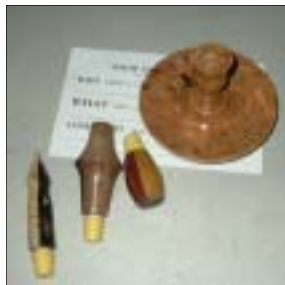
Tom Taylor's Turned candle holder and bottle stoppers.