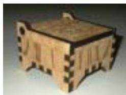
Inlay carving done by Dan Hope.