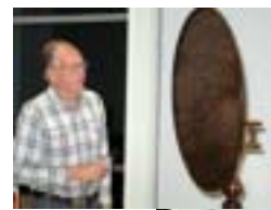
This one deserved a few pictures. Look at this beautiful workmanship.