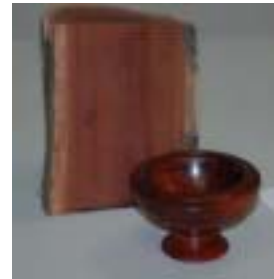
Corwin Jones' goblet from mystery wood