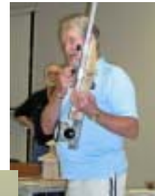
Don Robinson's Pin Router Template