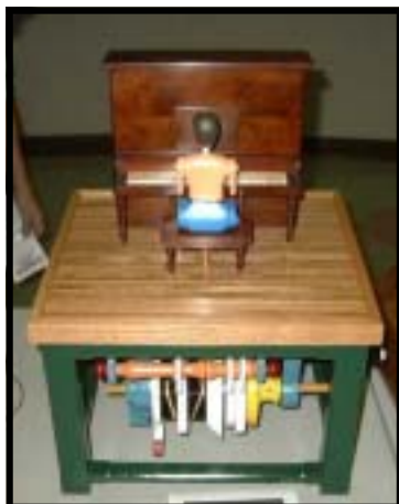
Rollie Bowns, crank driven piano player