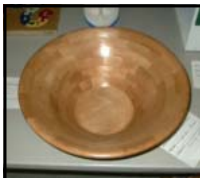
Jack Rexroad, segmented salad bowl made from Beech wood.