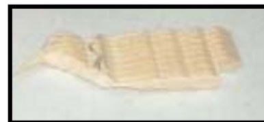
Neil Knutsen, scroll saw birds. They are made from sugar pine. He makes the flat cuts, as seen in the lower right picture. Then immerse the head in water up to where the feathers start, for about twenty minutes, then spread out the wings. (Very carefully)