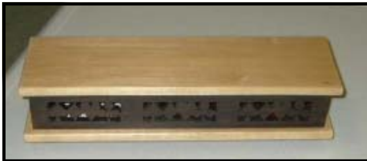
Bert Fortier, tied for fourth place