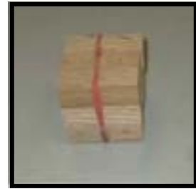
Abe Low, Puzzle (die) Easy to make, hard to solve. You have to arrange the pieces to form a single die.