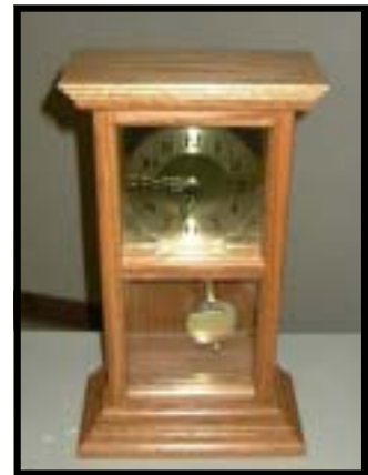
Sorry, I didn't a name on this one.