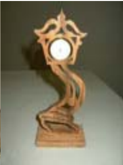
Hildegard Fortier Third Place