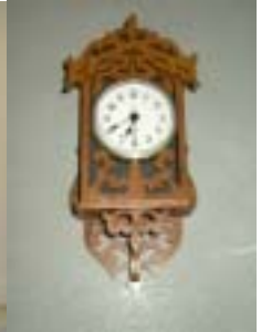
Buzz Arnould Second Place