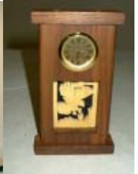
Neil Knutsen Forth Place