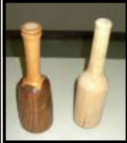
Dan Moening, Black Acacia / maple and cherry / maple mallets. 1st attempt at veneering