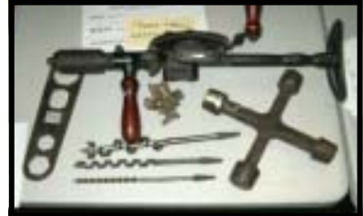
Frank & Brian Lentsch, Old tools, four way water wrench, fit only water nuts. Ford wrench, a early model cord-less drill with bits. Also a depth gauge for drill bits.