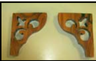
Bob Schieck, Chess board and shelve brackets