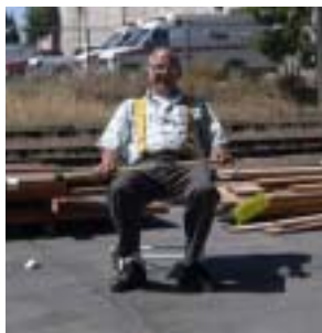
Doing what he does so well.