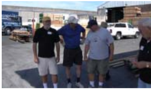
What do mean "My pants are too short and I need some white sox's"