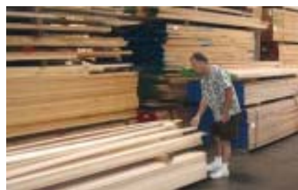
Looking for that perfect piece