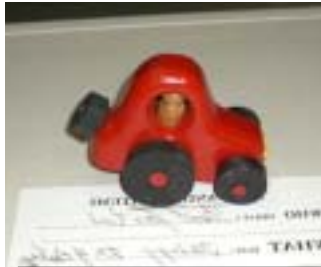
Bert Fortier, small car for the toy program. He has offset the front axle and installed a cog in the rear axle to make the car and driver move up and down.