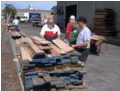
Okay, you can have that one, but the rest is mine.