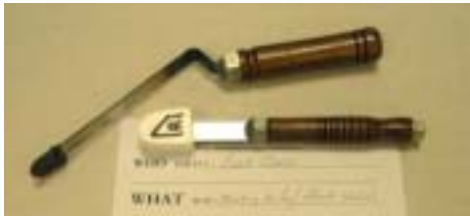
Curt Clark, Marking knife/offset chisel. Curt has come up with a great way of making useful tools out of old planer blades. The handles are made of walnut. Great scrapers for cleaning glue joints in tight places and making fine marks instead of using fat pencils.