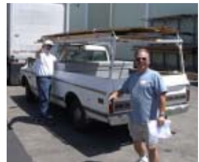
Another load on its way home