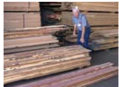
Boy is it going to smell good in his shop.