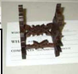
Hildegard Fortier, scroll sawn pencil holder.