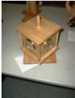
Floyd Gibson 3rd place revolving barometer, clock