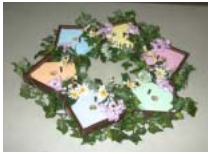
Doris Woods, Bird house wreath, partially painted at tole painting SIG and finished with artificial flowers