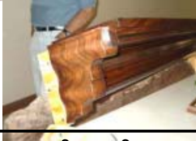
Cameron Campos, Walnut mantel, this is another piece made from a rough cut wal- nut tree years ago. (in the picture below the mantel) The wood had been in his customer family for sometime.