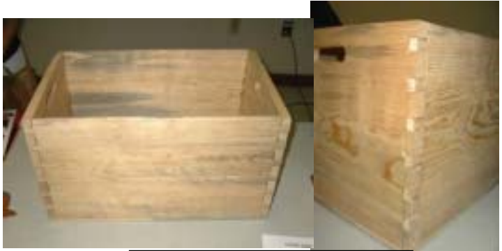
Bob Buckwalter. Hand cut dovetails in a apple box.