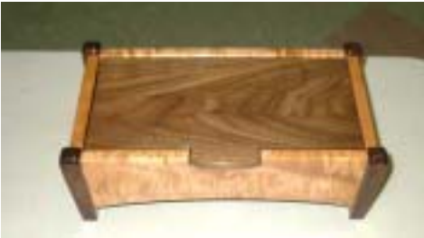
Judy Wavers, Maple & Walnut jewelry box