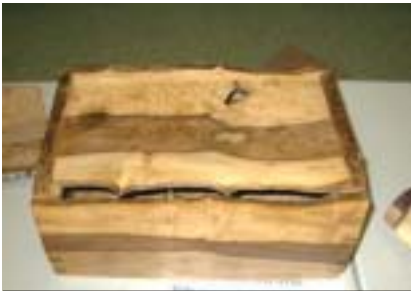
Abe Low, Warp wane & cup box or is it a warp cup & wane box? Made from a tree SMUD cut down and when dried, it cupped and warp. Who says wood has to be flat and square, to make a beautiful piece.