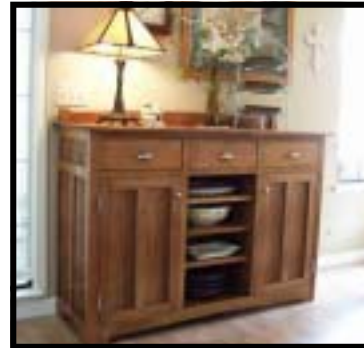
Curt Clark , new member in April. Quartersawn red oak and red oak ply with a Minwax dark walnut stain and finished with Tung oil.