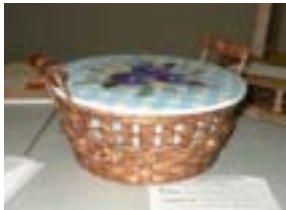
Judi Curnow, tole painted the lid, then added the cloth enter lining. Embroider the inside on her sewing machine.