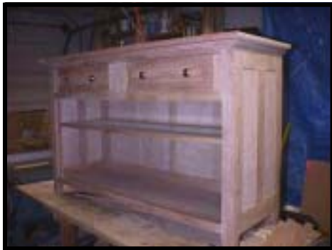
Lloyd Gavin , done in cherry, a finished picture to come.

Projects too big to bring in to Show & Tell