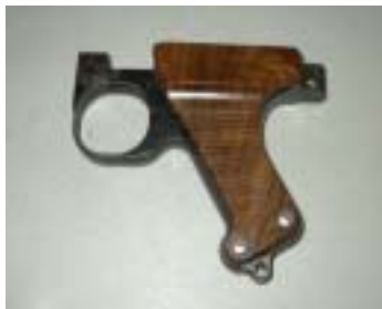
Michael Bush, walnut pistol grip.