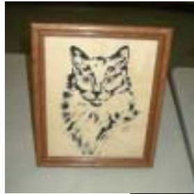
Buzz Arnould, cat picture, cut with spiral blades, on 1/8 plywood. Animal puzzles cut on scrollsaw. He burned the edges to accentuate the names of each.