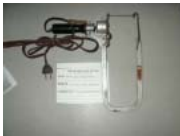
Joe Schuchmann, Power coping saw