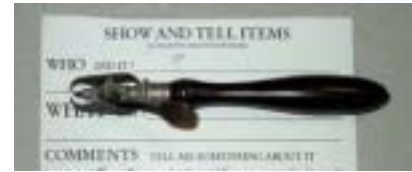
Chuck Renda, Tool for removing the hands of clocks